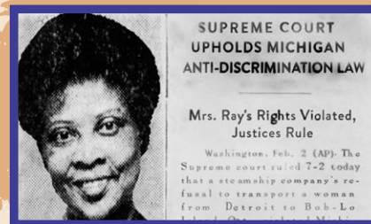
US Supreme Court rules in Sarah's favor, 1948

5. Let's look at the "2021 Word of the Year" selected by Dictionary.com: allyship . What is allyship ?